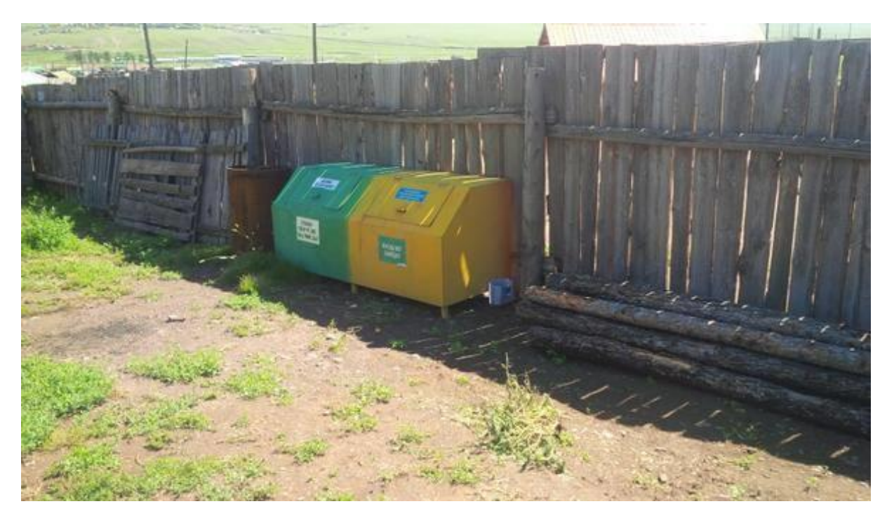
Example of waste bin in Bulgan soum (from inside a khashaa)