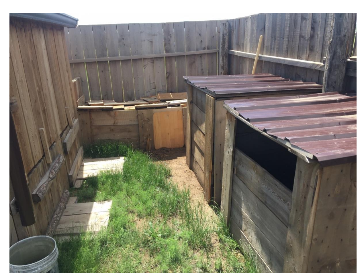
Dry toilets composting boxes (which can also be used for organic waste) located right behind toilets