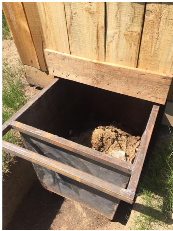
Back door to access collection cart (positioned below toilets)