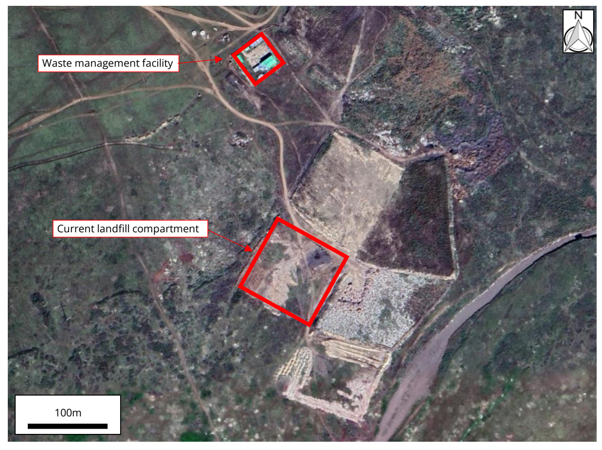
Map #2: Position of Bulgan soum's waste management facility and current landfill compartment