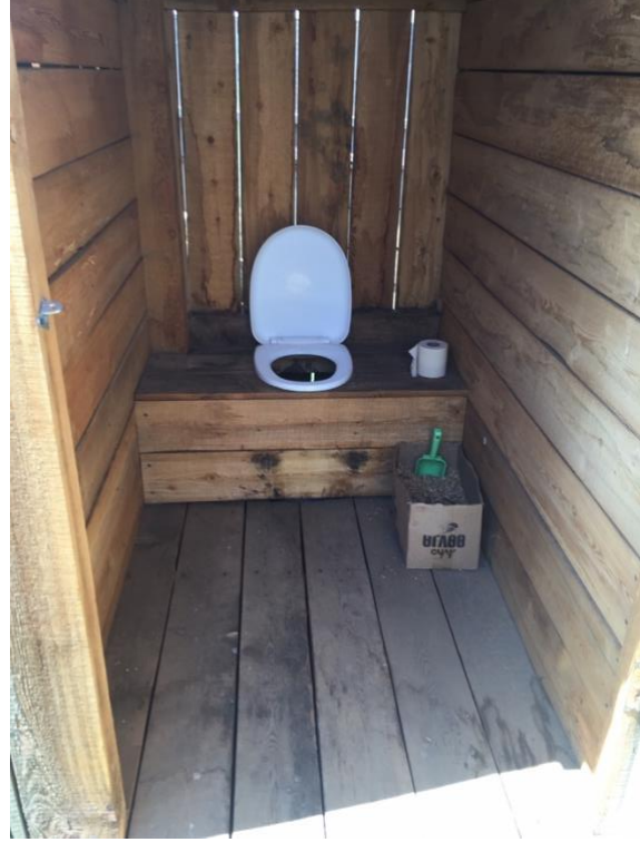
Possible arrangements of dry toilets : hole (similar to pit latrine) or seet (similar to apartment toilet)