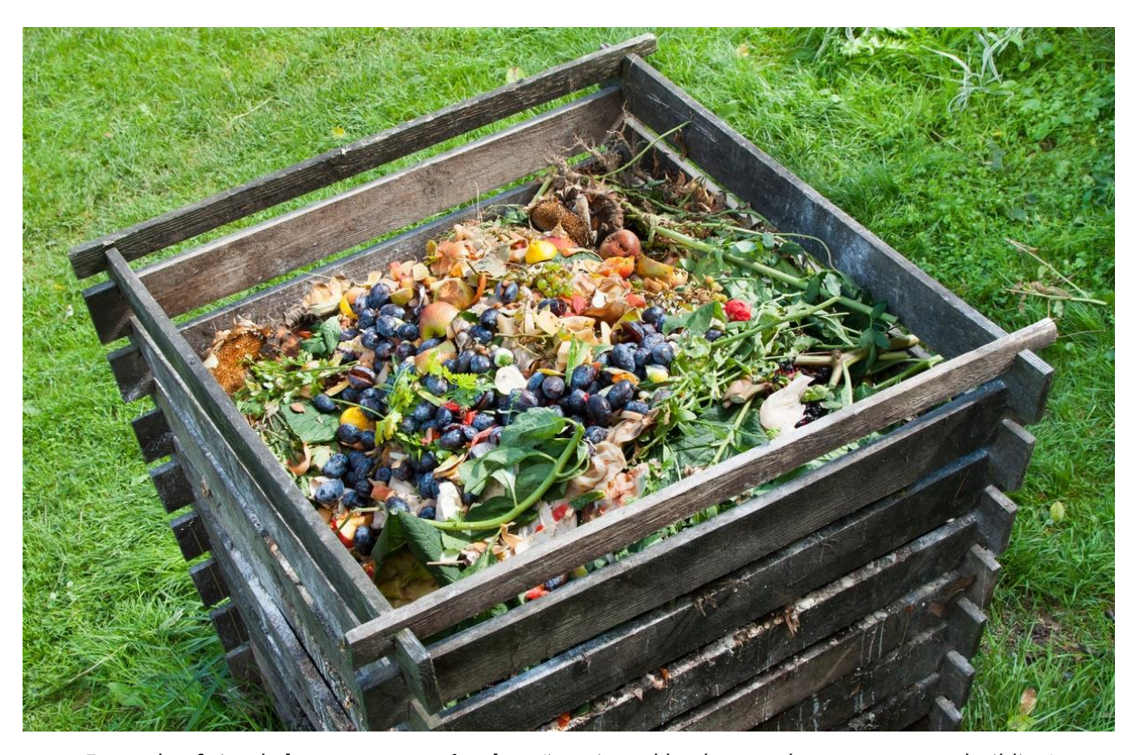
Example of simple home composting box (in private khashaa or down apartment building)