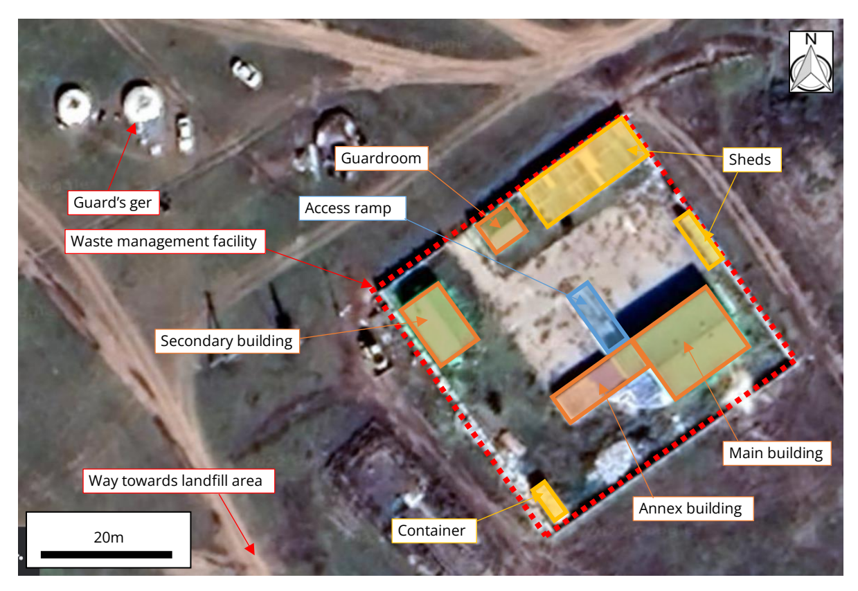
Map #3: Current arrangement of Bulgan soum's waste management facility