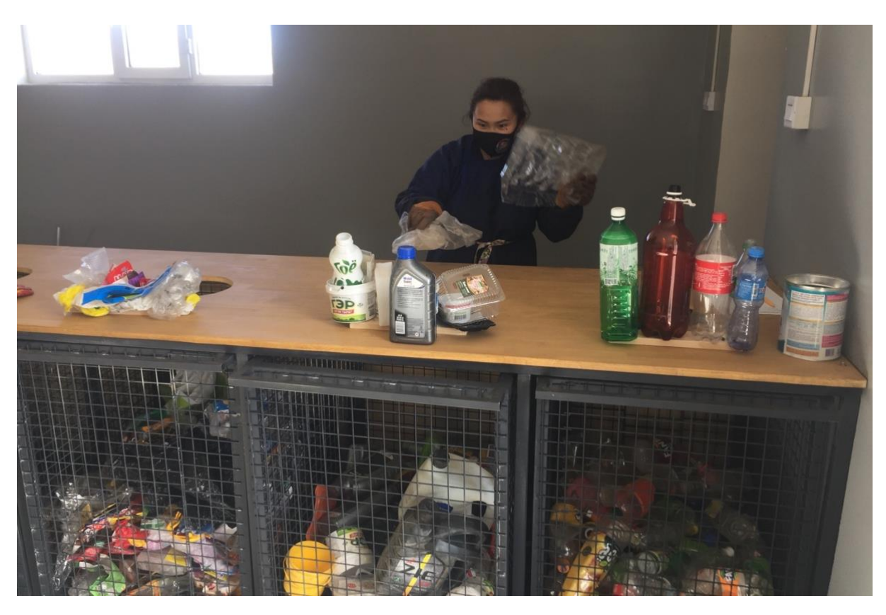
Example of waste producer disposing waste in sorting workbench in waste mananagement facility