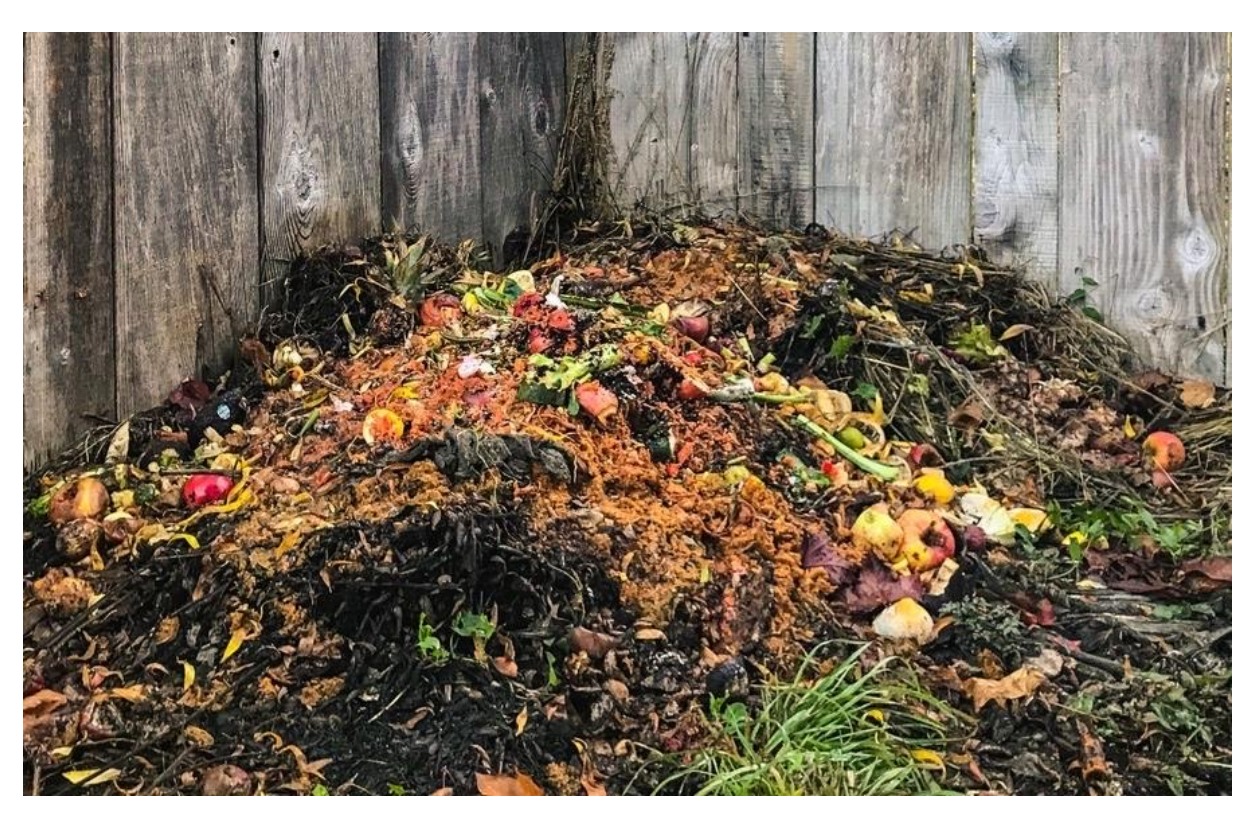
Example of simple home composting pile (in corner of khashaa)