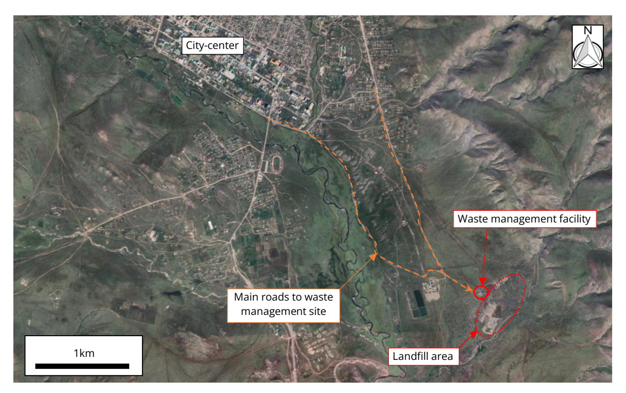
Map #1: Location of Bulgan soum's waste management site (facility and dumpsite)