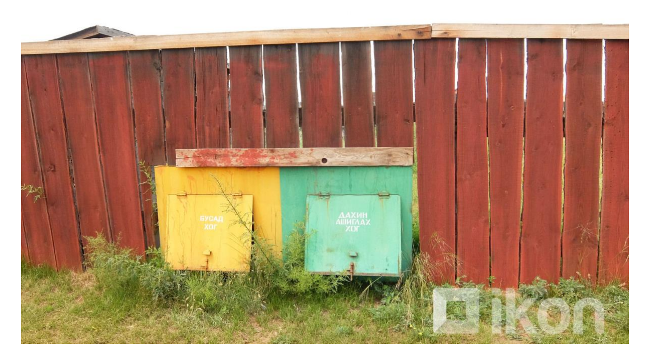
Example of waste bin in Bulgan soum (from outside a khashaa)