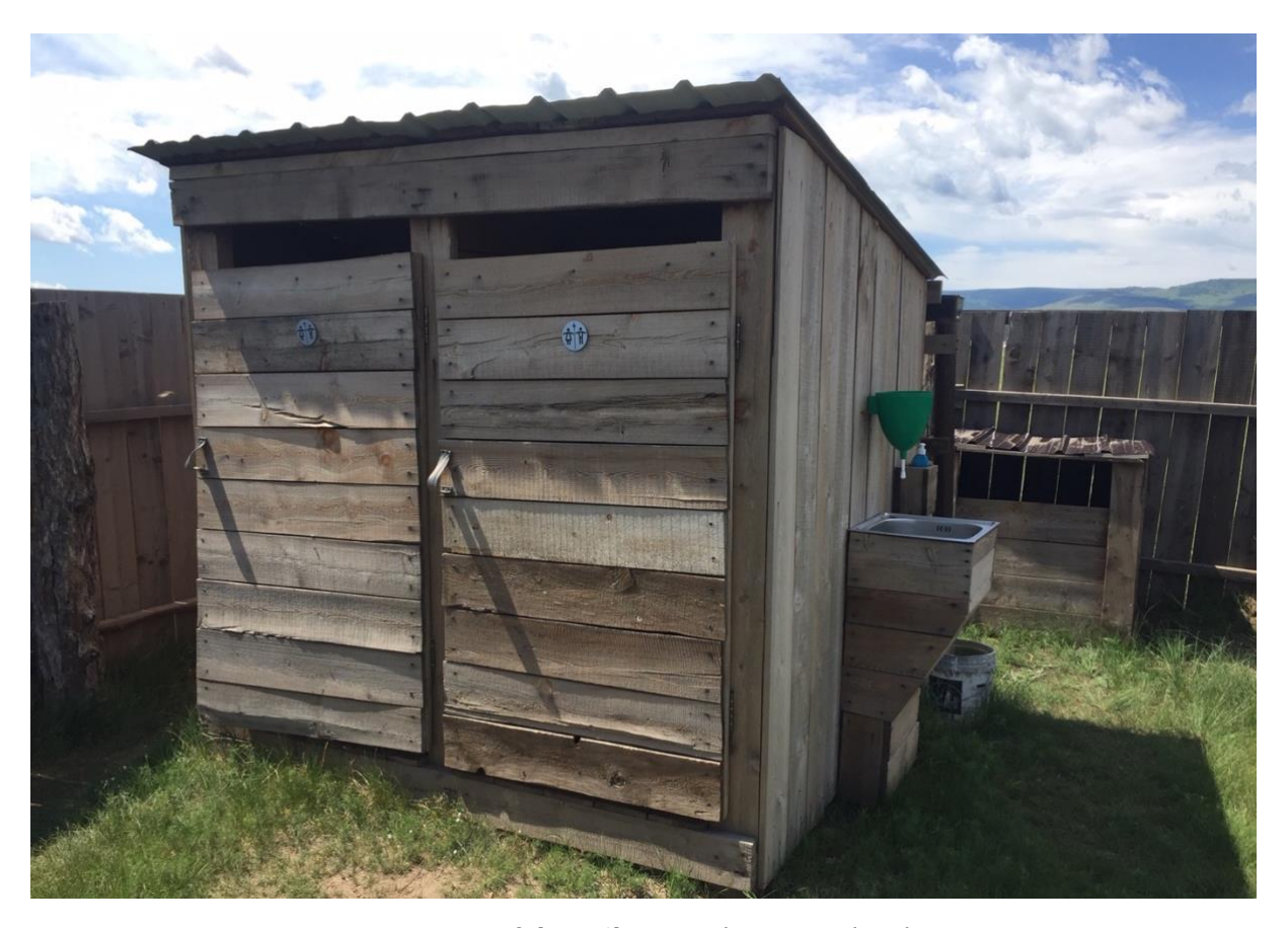
Main structure of dry toilets (similar to usual pit latrine)